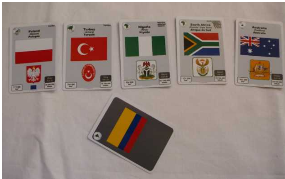
A game in action: what is this country with that yellow-blue-red flag? Where to place it according to its area?

Consequently, the cards form a line ordered with increasing area or population, in which the players come successively to place their cards one after each other.